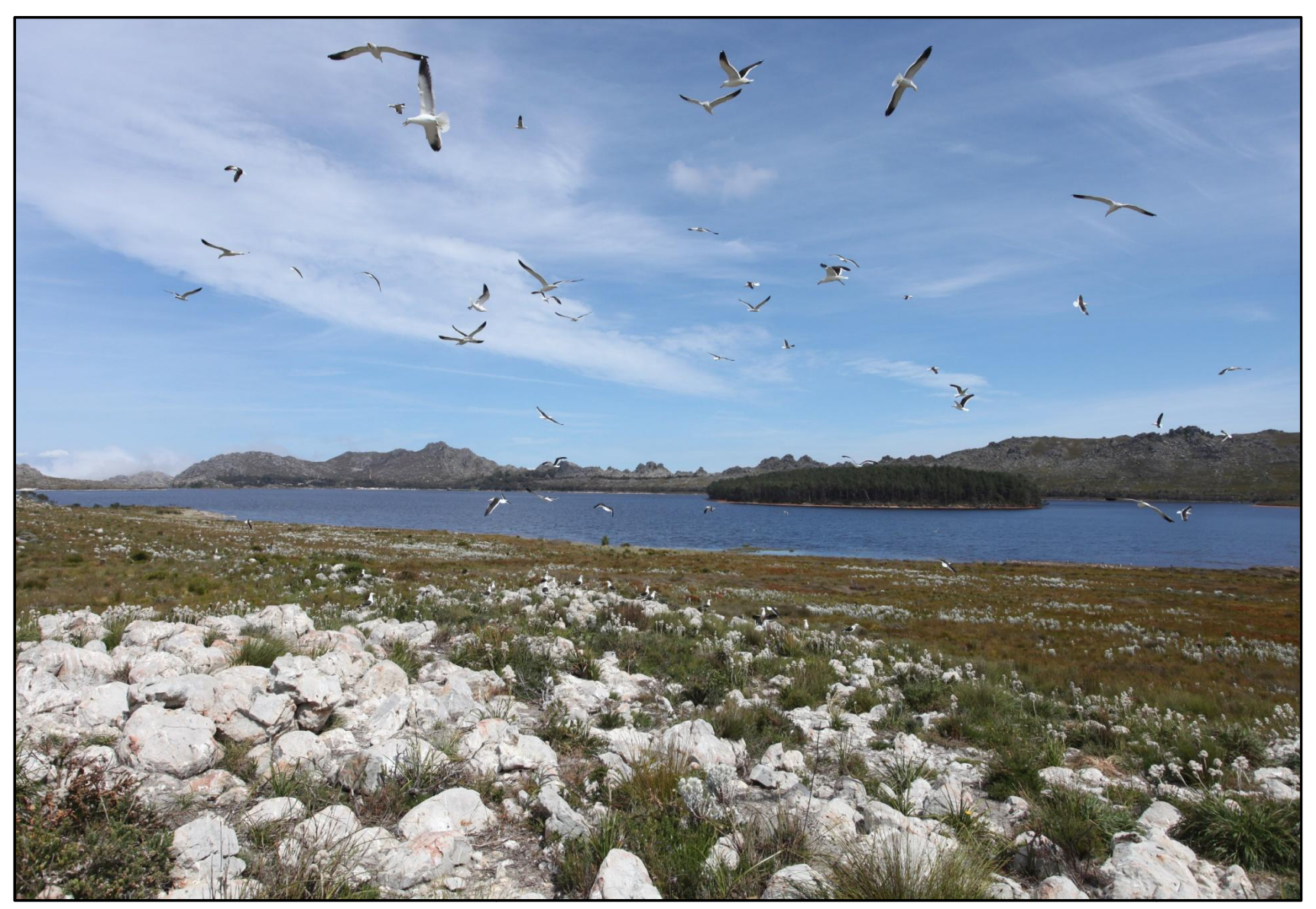
Fig 1 - Part of the Kelp Gull colony in mountain fynbos adjacent to Steenbras Dam. Note the guano staining and trampling in the left foreground resulting in local die back of fynbos vegetation. The pine-covered island in the background was the gulls' traditional roost site in Steenbras Dam.