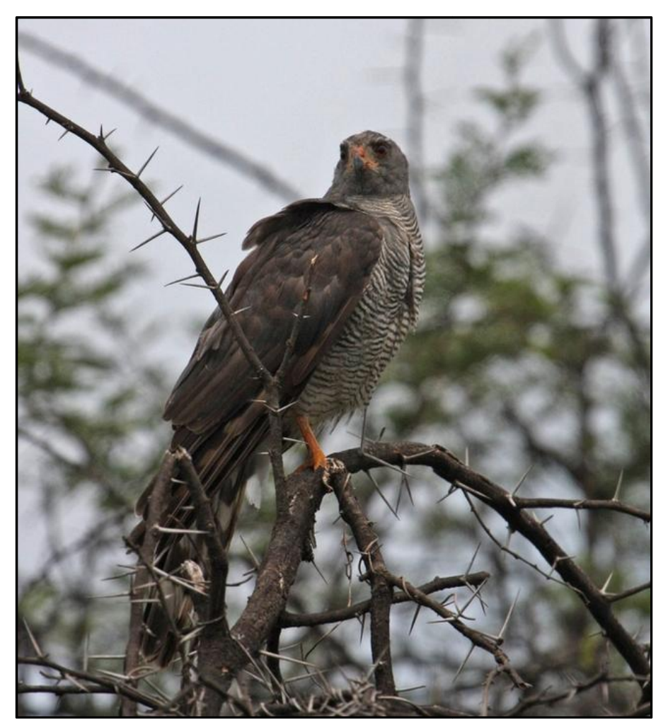
Fig 1 – An Ovambo Sparrowhawk overlooking its territory from a hunting perch in an Acacia tree.

Ovambo Sparrowhawks exclusively take birds as quarry (Kemp et al. , 1975; Allan et al. , 1984; Tarboton et al. , 1984) and the list of prey