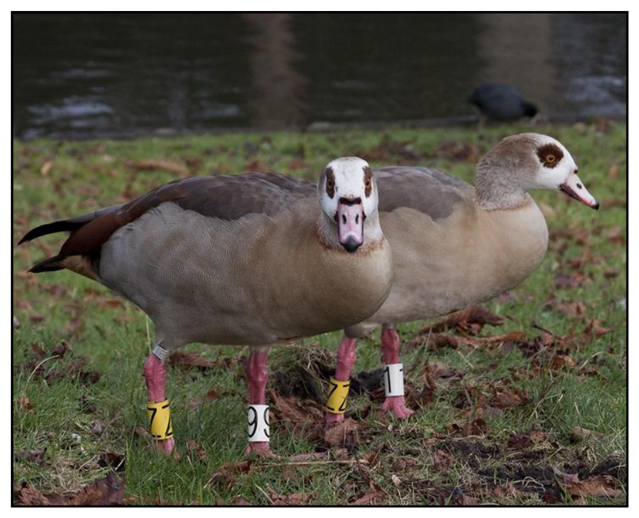
Fig 1 - The main pair in its breeding territory in the Noorderplantsoen, city of Groningen, The Netherlands, (male to the left, female to the right, 4 December 2011).

One of the fledglings of 2010, a female, established with an unringed 2CY male a territory in the northern part of the park in 2011. Breeding was not recorded in 2011, breeding failed in 2012 (no young recorded). Her partner was colour-ringed in May 2012. The