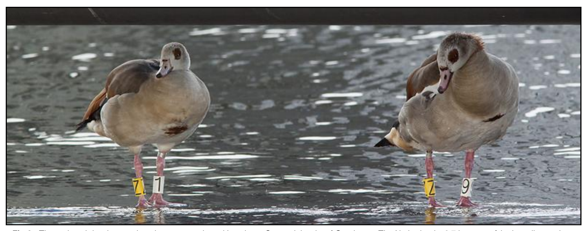
Fig 2 - The main pair in wing moult at the communal moulting site at Oostersluis, city of Groningen, The Netherlands, 2.7 km east of the breeding territory (female to the left, male to the right, 26 July 2011). On 19 July 2011, both had started with moult a few days earlier.

It was almost constantly brooded during a cold spell in late March. The young was only guarded by the male onwards from 1 May. The female was recorded on 6 May, she returned soon to a nest. It was at the same site as her first nest. At least eight young were hatched on the late evening of 4 June. Eight were present on 5 June, all eight fledged (five were colour-ringed). Several encounters of agonistic behaviour of the first generation young towards her siblings, including biting, were recorded in the first few days after hatching. The oldest young was a female. She was also colour-ringed and she stayed for the entire period together with the rest of the family (Fig 3).