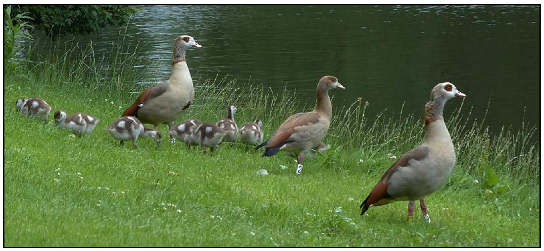
Fig 3 - The main pair (female to the left, male to the right) with a double brood, city of Groningen, The Netherlands, 23 June 2013. The young of the first clutch (middle) was hatched on 21 March, the eight young of the second clutch were hatched on 4 June. All young fledged.