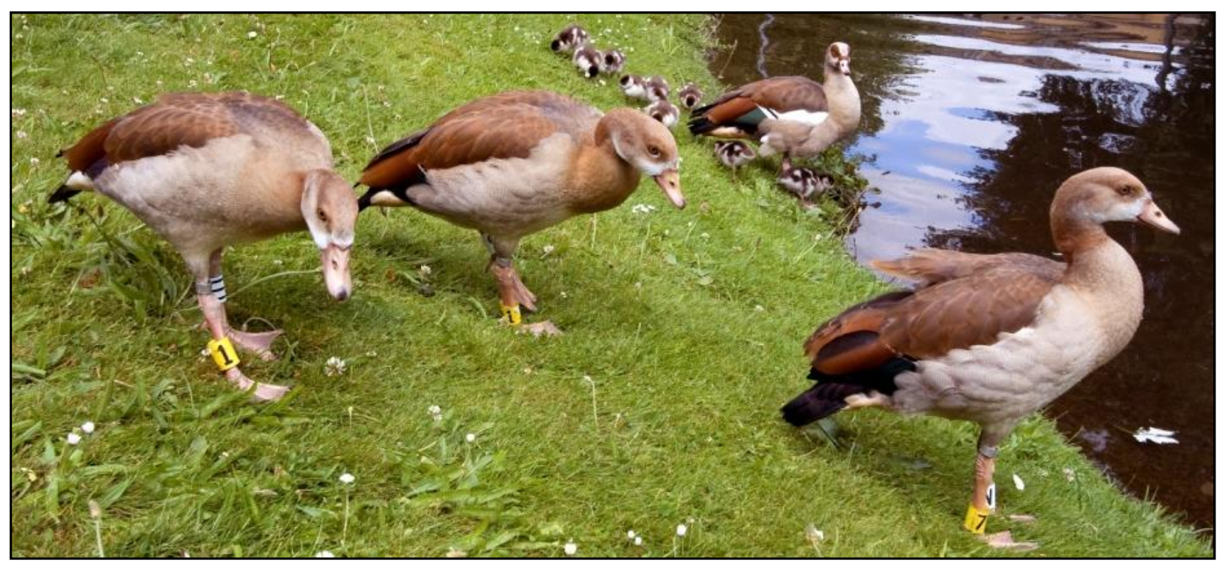
Fig 6 – Breeding pair of Egyptian Geese with a double brood in a city park in Arnhem, The Netherlands, 4 June 2009. © Koos Dansen Three young of the first generation (in the front) were seen for the first time on 30 March (hatched one or a few days earlier, all three fledged), nine young of the second generation (in the back) were seen for the first time on 1 June (hatched one or a few days earlier, all nine fledged). Source: database of Frank Majoor (see Table 2 for details).

Once again, very little about post-hatching brood amalgamation in Egyptian Goose can be found in the literature. Beauchamp (1997) states in his extensive review that both pre-hatching and post-hatching brood amalgamation do not occur. Cramp and Simmons (1980) don't provide details. Other sources indicate that post-hatching brood amalgamation might occur occasionally. A note and a letter in British Birds (Bloomfield 2001, Sage 2001) document