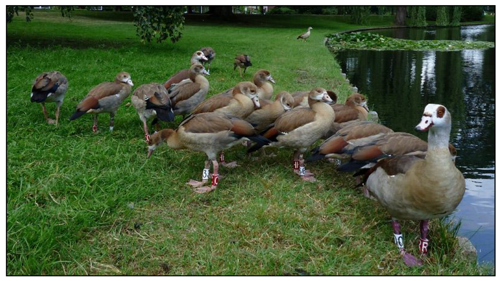
Fig 5 - The main pair with 17 young of three different broods, city of Groningen, The Netherlands, 8 August 2014. The female is guarding at the back, the male (red R / white 0, formerly white 9 / yellow Z) is guarding in front. The flock consists of one young of the first clutch, 6-9 young of the second clutch, and 7-10 young added through post-hatching brood amalgamation (see Figure 4 for details). All 17 young fledged.

The parents moulted while raising their young, moult was finished before the young were able to fly. The female started with shedding her primaries on 8 August, the male started eight days later. The 2011 daughter established a breeding territory with an unringed male