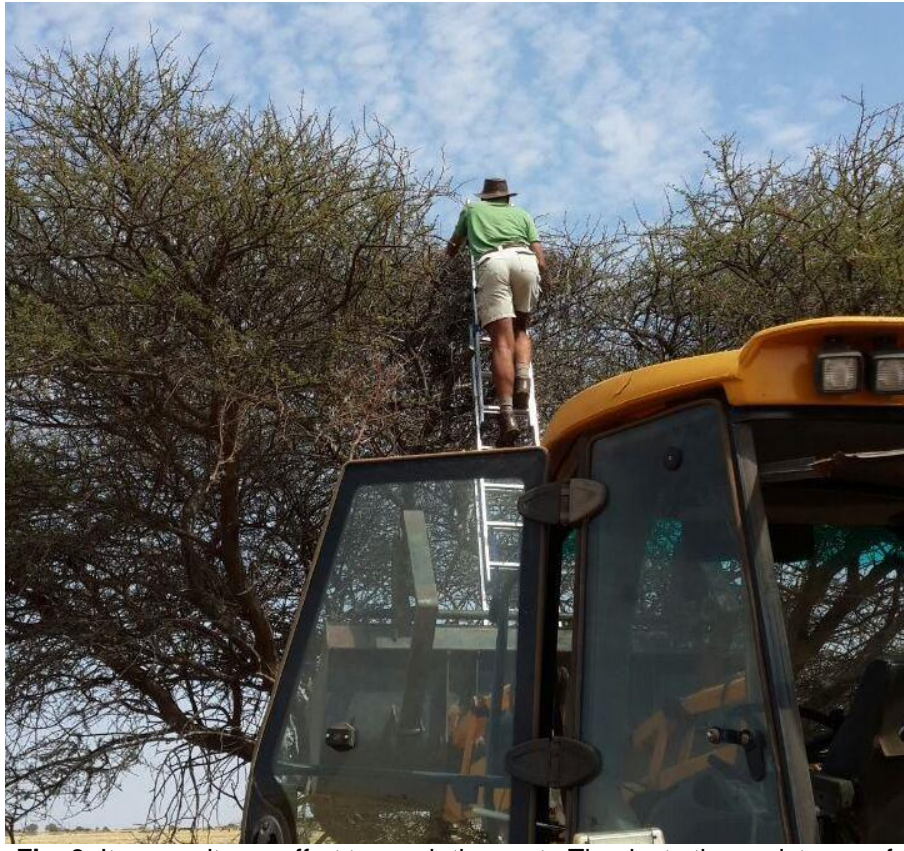
Fig. 3. It was quite an effort to reach the nest. Thanks to the assistance of the farmer with every visit I was able to reach it withstanding with ladder on TLB or cattle truck!

building period could be collected. The nest was already completed (with no eggs in it) on the first visit in late May 2014, so the nest completion date is unknown.