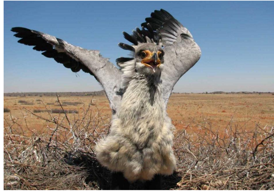
Fig. 5. The Secretarybird nestling was ringed in the nest on 6 November 2014 and was about 7 weeks old. The nestling was standing on its heels and with open wings giving croaking calls.

Tarboton WR 2011. Roberts nests & eggs of southern African birds. John Voelcker Bird Book Fund. Cape Town.