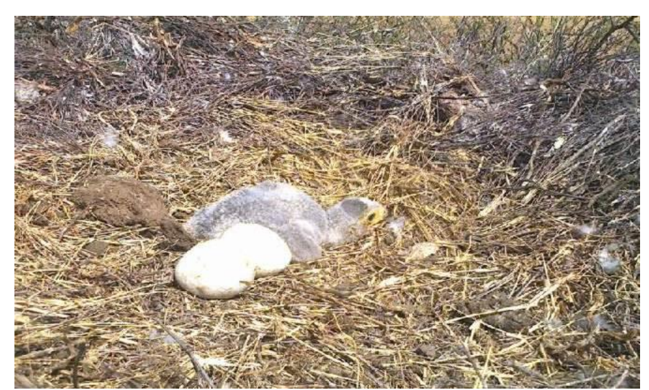
Fig. 4. Only one egg hatched from a 3 egg clutch. The Secretarybird nestling was about a week old on 26 September 2014. During this visit the female was still sitting covering the chick.