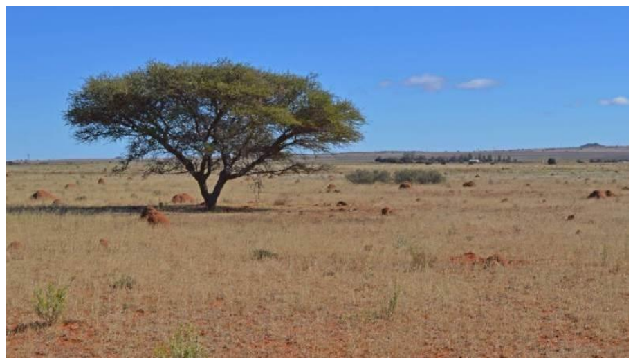
Fig. 2. Closer view of Secretarybird nest on top of Vachellia tree. The nest is 6.5 m in the centre of the crown of the tree