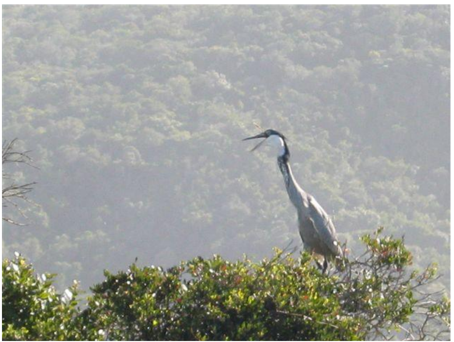
Fig 2 - The large lump going down the throat of the predator

tools possessed by raptors, the despotic heron managed to swallow the dove only after chopping it into bits with its sharp beak" (Kahindi 1996).<sup>1</sup>