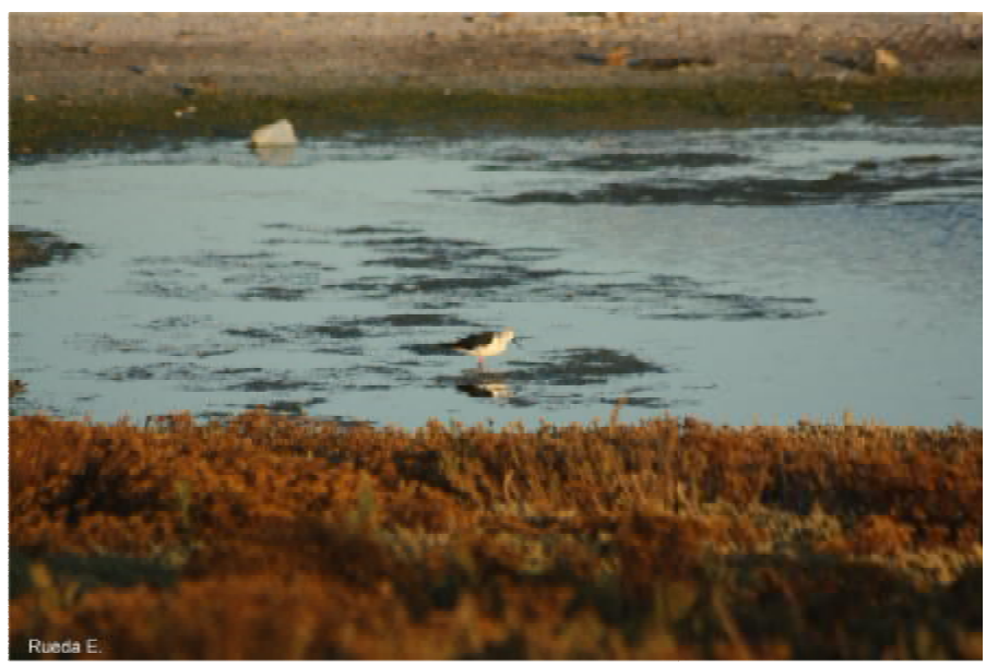
Fig 1 – Black-winged Stilt foraging in the stone quarry at the north end of Robben Island – 8 December 2012.

The Black-winged Stilt is a common breeding resident in southern Africa, typically found at extensive open, shallow waters, but it is also found at coastal lagoons, saltpans and other forms of evaporation ponds. The highest reporting rates are in the Western Cape, Free State and northeastern Botswana (Tree 1997). Underhill et al. (1999) estimated there to be 15 000-30 000 Black-winged Stilts resident in Southern Africa (south of the Zambezi and Cunene Rivers). One of