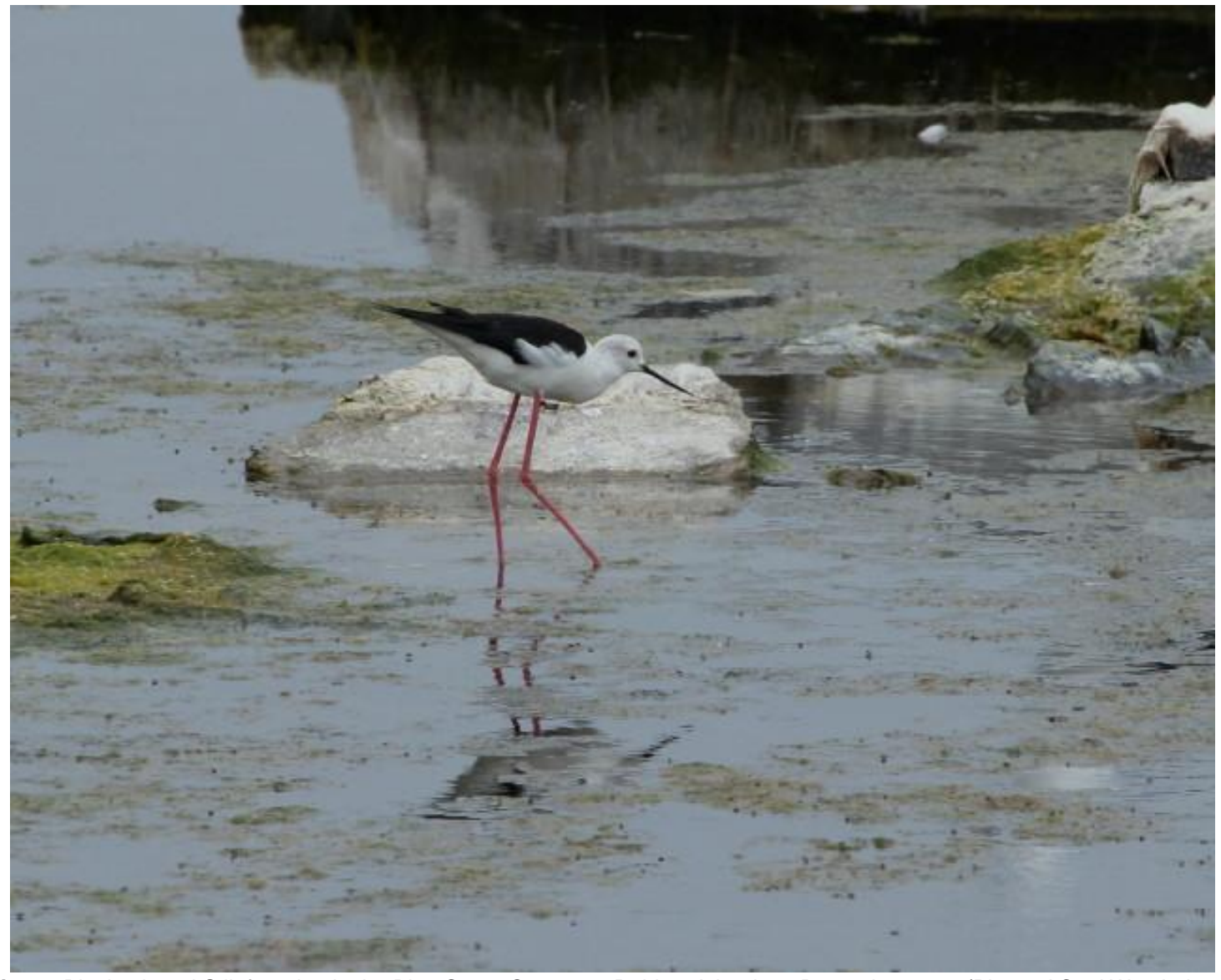
Fig 2 – Black-winged Stilt foraging in the Blue Stone Quarry on Robben Island – 3 December 2013