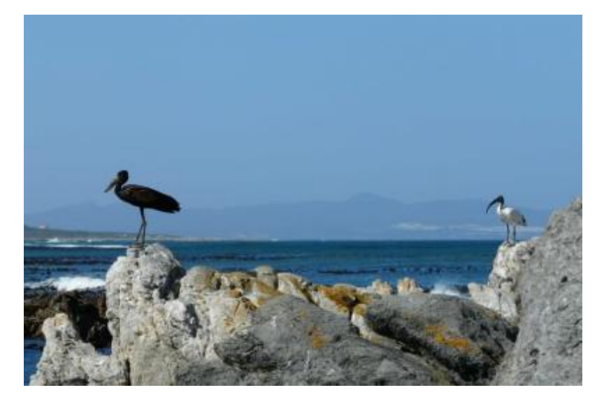
Figure 2 – African Openbill on seashore rocks at Vermont, Western Cape

list of prey items, which rarely varies from molluscs and bivalves (Anderson 2005).