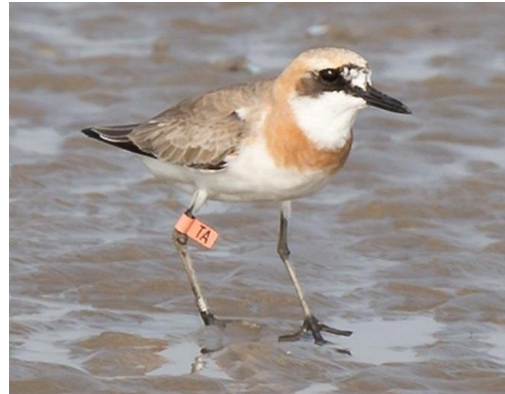
Figure 1 - Greater Sand Plover with flag 'TA' photographed at Modhava Beach, Mandvi, India, 10 April 2015.

Until 2015 there had only been two recoveries of ringed birds from all waders ringed on the East African coast: a Lesser Sand Plover recovered on the Pakistan coast in 1985 and a Terek Sandpiper controlled on its nest in Finland in 2008 (Ringing Scheme of East Africa unpubl. data). Over 150 re-sightings of flagged birds have been made at Mida Creek and the adjacent Watamu beach spanning all years since 2010. Three Greater Sand Plovers have been seen with colour flags at Sabaki River Mouth c. 27 km to the north and one colour-flagged Terek Sandpiper was observed at a roost on saltworks at Gongoni c. 45 km north of Mida Creek.