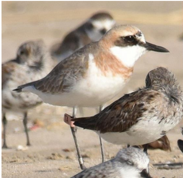
Figure 2 - Greater Sand Plover with flag 'TA' photographed on Modhava Beach, Mandvi, India on 29 March 2016.

On 10 April 2015 a Greater Sand Plover with an orange leg flag and the inscription 'TA' was photographed on Modhava beach near Mandvi, Gajarat, India (22°46'N 69°26'E) (Fig.1). This was ringed as Nairobi Museum A70821 on 8 November 2004 at Mida Creek by A Rocha Kenya as an adult. It was then retrapped on 16 September 2013 at Mida Creek also by A Rocha Kenya when the leg flag was attached. Remarkably, a year later on 29 March 2016 the same Greater Sand Plover—orange flag 'TA'—was photographed again at the same Modhava beach, Mandvi, India (Table 1, Fig 1). This was the first recovery of a Greater Sand Plover from the East African coast. There is one other recovery of this species in Africa—one ringed on the Sudanese Red Sea coast in September 1981 and killed on its nest in Syria the following April (Nikolaus & Backhurst 1982).