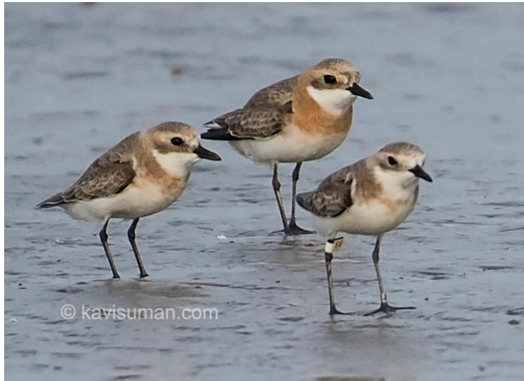
Fig 3 - Lesser Sand Plover with flag 'S0' photographed on Modhava Beach, Mandvi, India on 22 May 2016.

The first alternative is unlikely. Birds will always minimise the amount of weight they need to carry for flight (Newton 2010). If Kenyan birds fatten to around 100–110 g before departure to take them 4,300 km, then Australian birds are carrying probably 30 g or more of additional