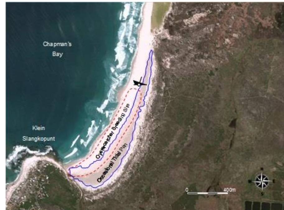
Fig 1. African Black Oystercatcher breeding site at Noordhoek beach. The area outlined in red (up to the shipwreck) is restricted.

breeding pairs at this site for the Oystercatcher Conservation Program (OCP). Within a few days of 10 February 2013, one of the pairs I was monitoring re-laid a clutch of two eggs after losing their one-egg clutch earlier that season. As the pairs on this breeding site rarely hatch any chicks (Pajmans 2014) this clutch failure was not a surprise. This is usually a result of regular flooding at spring tide and heavy predation (pers. obs.). Over the next few weeks I returned to the site as part of the study and on 7 March 2013 the two eggs were found to be freshly hatched, the chicks' bills still having 'egg teeth' (Fig. 2).