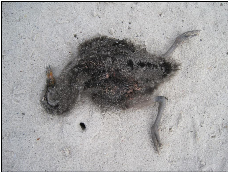
Fig 3. A freshly killed African Black Oystercatcher chick showing wounds on its abdomen.

Sanparks. An interactive guide to walking your dog in the park. Available from: http://www.sanparks.co.za/docs/parks_table_mountain/tourism/dog-walking.pdf (Accessed on 21.05.2015).