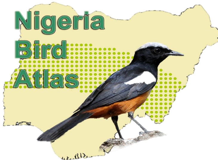
Figure 1. Logo of the Nigeria Bird Atlas Project (NiBAP)

Knowing where species occur – species distribution – is a fundamental first step towards their effective conservation. The Nigeria Bird Atlas Project (NiBAP) aims therefore to update information about the distribution of birds across Nigeria through a coordinated and rigorous