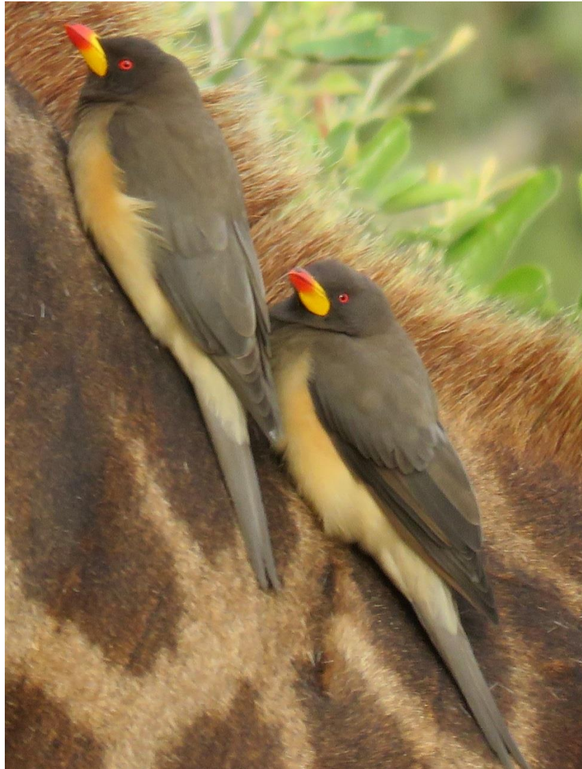
Figure 2: Yellow-billed Oxpecker on giraffe (pentad 2310_3115 Red Rocks Road 001 on 3 February 2016)

Both species thus occurred on 10 host species, which render an easy percentage of likelihood of encountering each species on each host species. Repeat surveys by other observers could refine the validity of this sample.