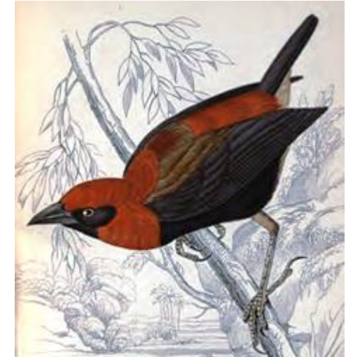
Fig. 1. Black-winged Bishop, figure from Swainson (1837).

Currently, 117 living species of weavers in the Ploceidae family are recognised. Hoyo et al. (2010) listed 116 species but Safford & Hawkins (2013) split the Aldabra Fody Foudia aldabrana from the Red-headed Fody Foudia eminentissima . Dickinson & Christidis (2014) also listed 117 species.