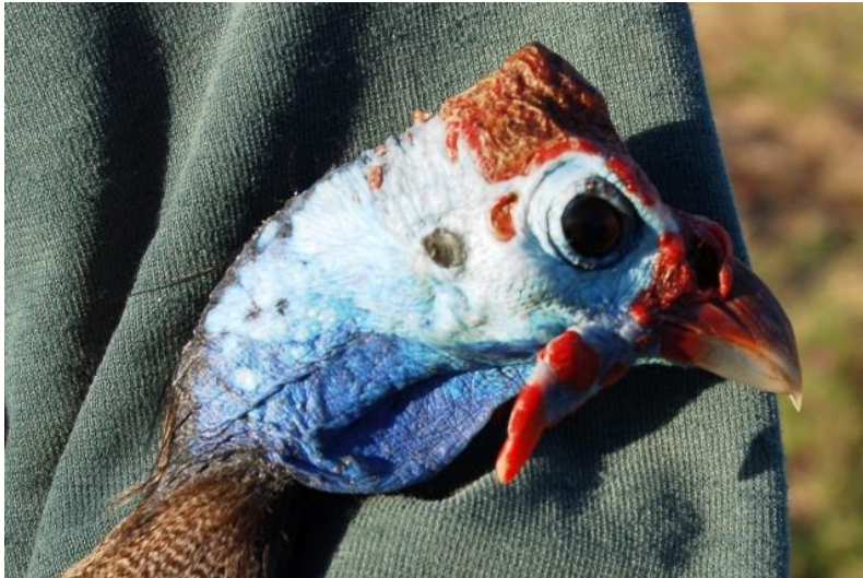
Fig. 2. Helmeted Guineafowl (ring 862414) head.

The ring was wearing away on the lower edge of the ring, already obscuring the bottom half of the first digit (Fig. 4), and thus a new, thicker ring (800060) was added on the other leg.