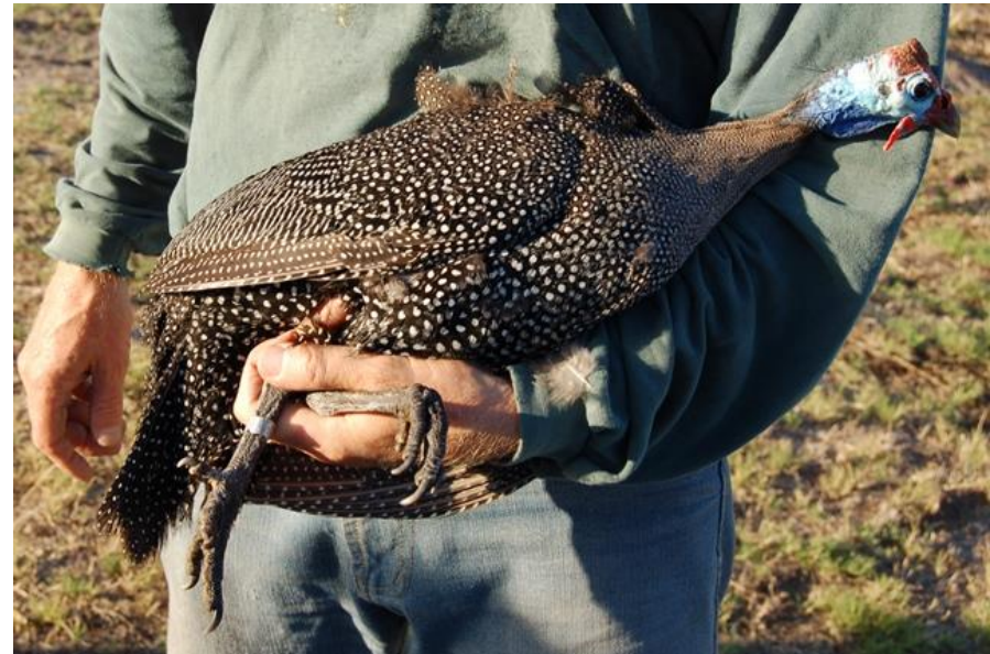
Fig. 1. Helmeted Guineafowl at the Diep River wetland, with ring 862414, aged 9 years, 2 months, 5 days.

Our first ringing session at this site was in January 2007 and we have ringed here at least once a year since. But ringing effort varied widely resulting in 20 to 297 birds being ringed per year at this site. The five top ringed species are Cape Weaver Ploceus capensis (256 birds ringed), Common Waxbill Estrilda astrild (221), Southern Masked Weaver Ploceus velatus (147), Levillant's Cisticola Cisticola tinniens