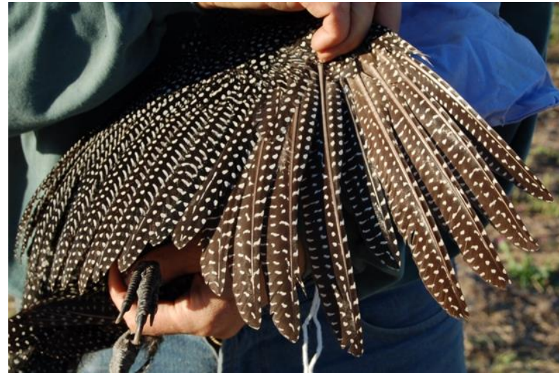
Fig. 3. Helmeted Guineafowl (ring 862414) primary wing moult.