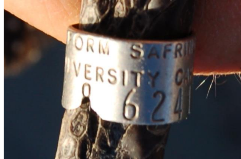
Fig. 4. Helmeted Guineafowl (ring 862414) ring wear.