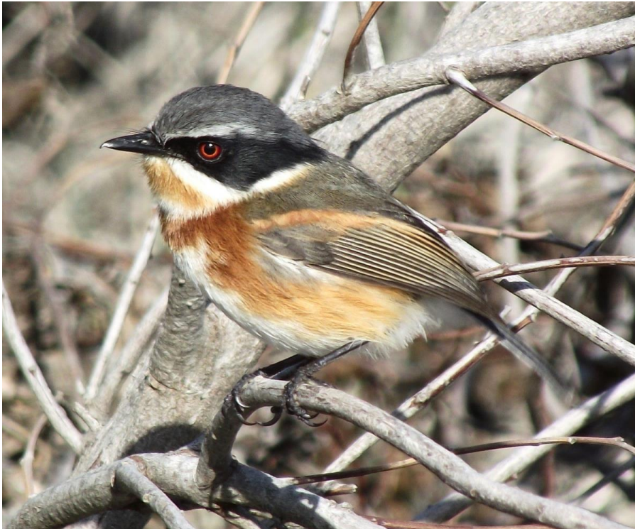
Figure 2. Cape Batis

The Cape Batis (Figure 2) is a common resident in most warm temperate regions across South Africa (Figure 3), inhabiting natural Afromontane and lowland evergreen forest, bushveld and acacia patches (Hockey et al 2005). They are absent from arid or very cold locations and are known to be altitudinal migrants between May and September (Hockey et al 2005). Migrants do not travel far from their breeding ranges (Hockey et al 2005), with a maximum reported displacement of 50 km (SAFRING unpublished data; Ring AR79788).