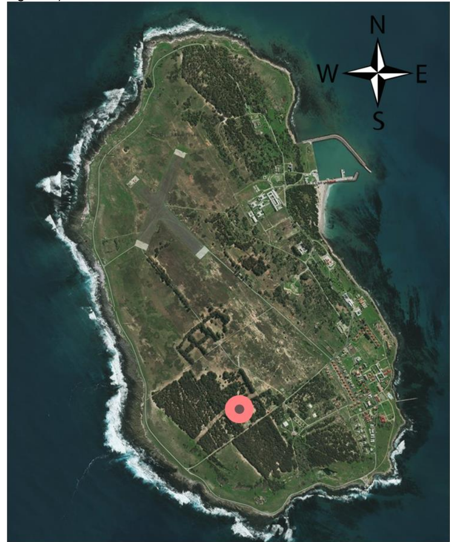
Figure 1. Site where three Cape Batis were seen on Robben Island.

of a eucalypt plantation (exact coords: 33°48'46.6"S 18°22'12.8"E; Figure 1).