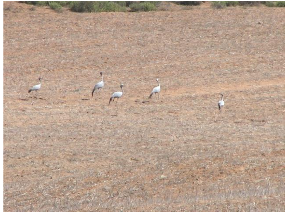
Figure 1 - Five Blue Cranes photographed on the farm Koegelfontein, Namaqualand, South Africa, about 105km north-west of any previous record in South Africa.

During survey work in Namaqualand, north-west South Africa, in April 2010, I found and photographed (Figure 1) a group of five Blue Cranes on the farm Koegelfontein at S31°02' 06", E17°55' 58". There appeared to be four adults and one juvenile, judging by the shorter tertial or "tail" feathers in one of the photographed birds. They occurred together near two large and full farm dams in habitat comprising a mixture of hayed fields, and natural Namaqualand Klipkoppe Shrubland (Mucina & Rutherford 2006, p251). This region is farmed with sheep and some cereal crops including oats in the valley lands between the smooth granite domes in an undulating