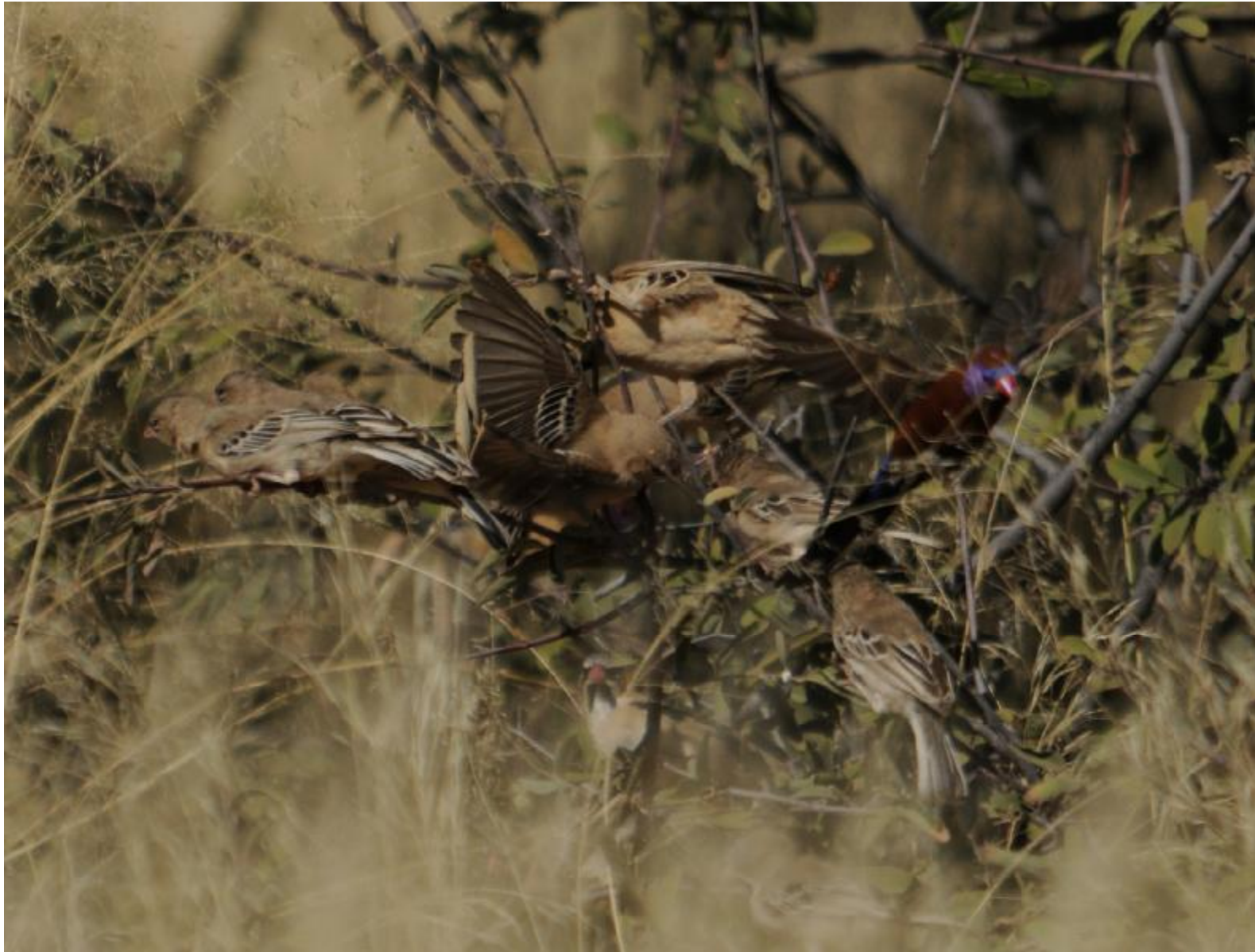
Figure 1 - The behaviour of the flock of birds near the base of a bush mobbing a Puff Adder.