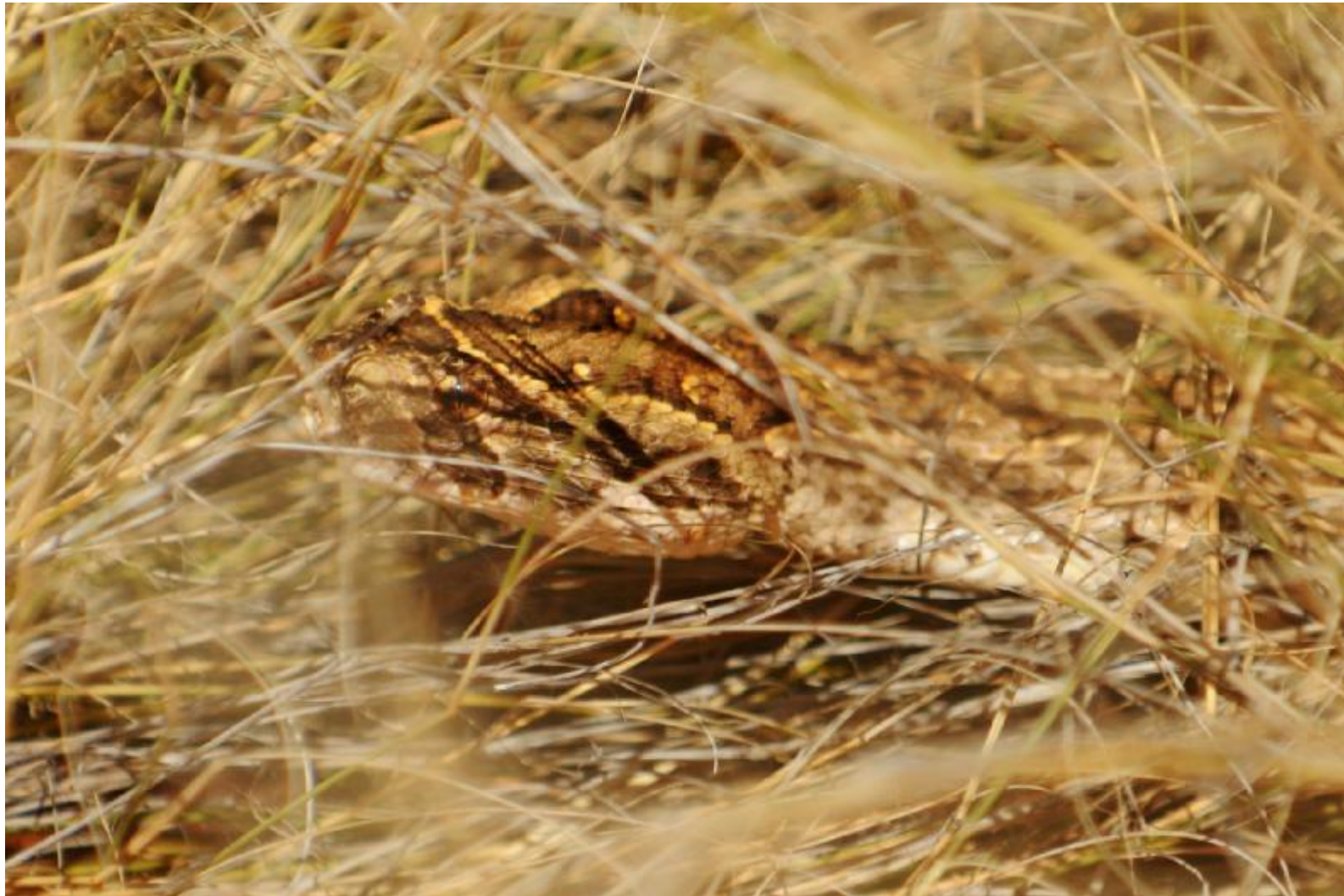
Figure 2 - The Puff Adder which was mobbed, partially hidden in grass