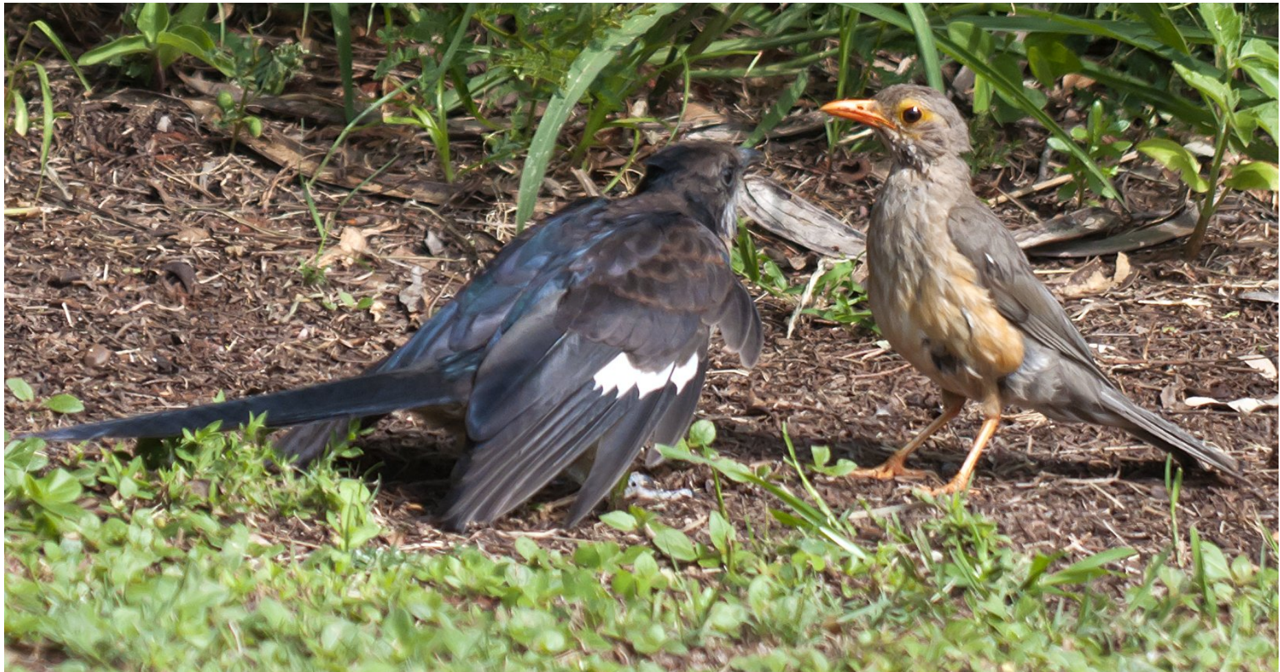
Fig 1 – Juvenile Levillant's Cuckoo begging food from the host – a Kurrichane Thrush.