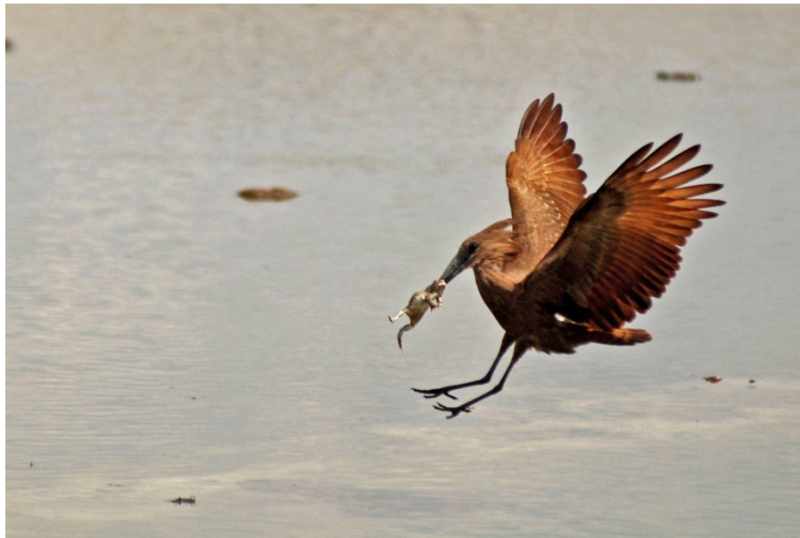
Fig 5 – The Hamerkop trying to escape from the kites