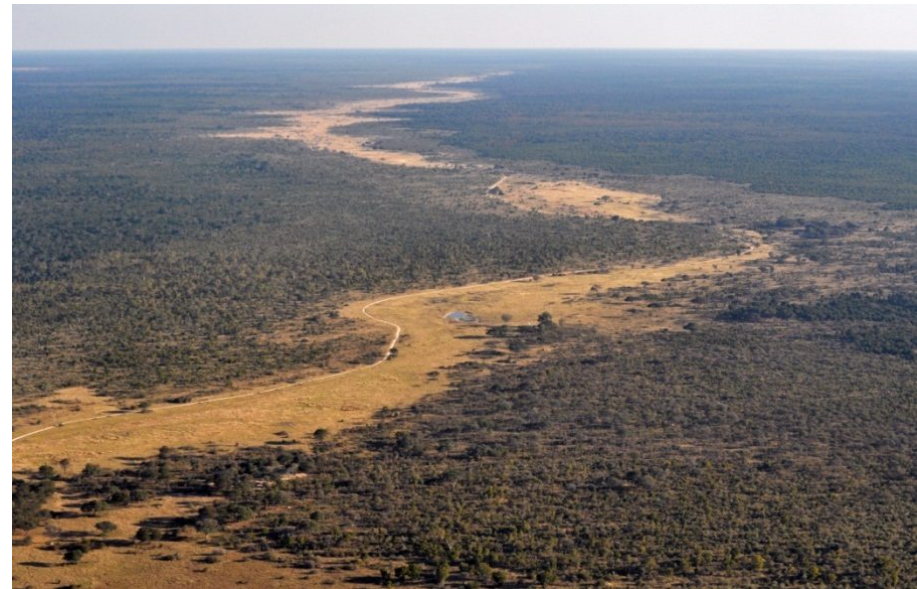
Fig 1 – The Kennedy Vlei with the Kennedy 1 waterhole

Suddenly, two Yellow-billed Kites Milvus parasitus , flew over the waterhole and started showing interest in the Hamerkop's prey.