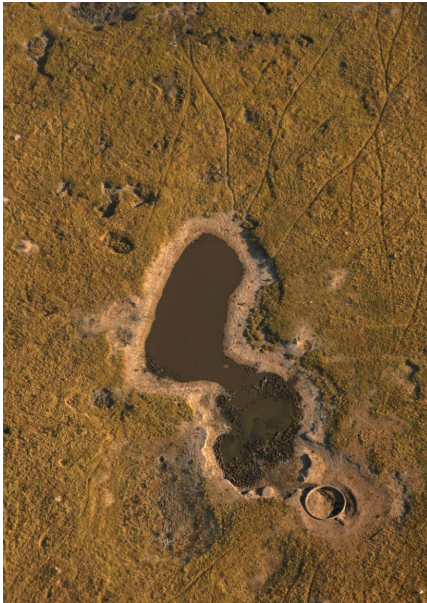
Fig 2 – Aerial view of the Kennedy 1 waterhole