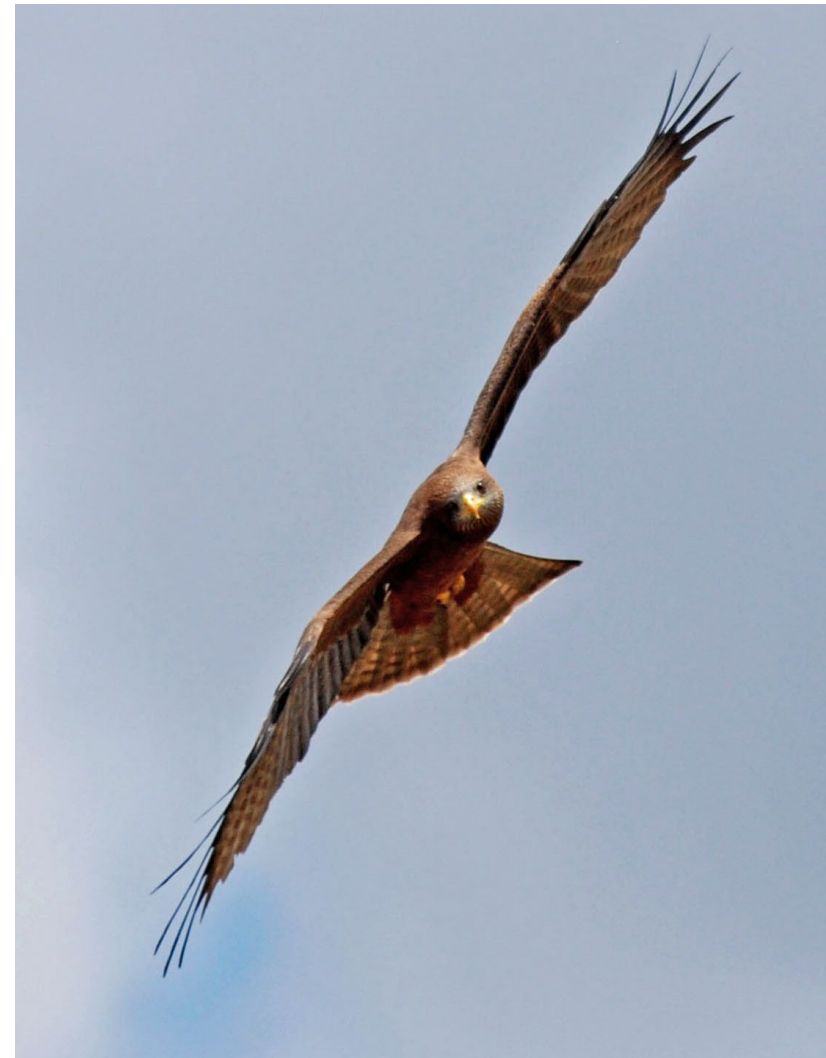
Fig 6 – A Yellow-billed Kite flying around the Kennedy 1 waterhole