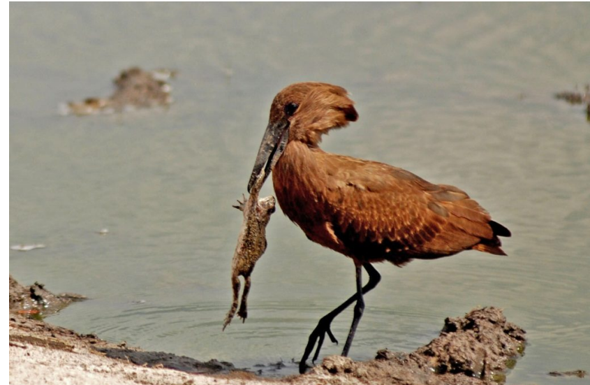
Fig 3 – A Guttural Toad caught by a Hamerkop