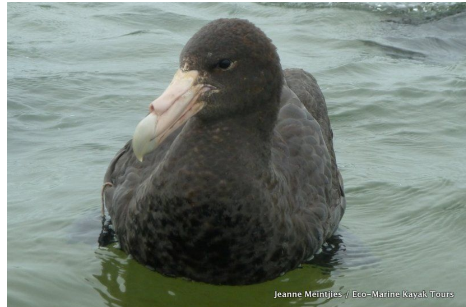
Fig 1 - Southern Giant Petrel approaching a kayak on 10 August 2010. Note string/line entangled around right wing.

The Cape Fur Seal population of South Africa and Namibia is relatively large and regarded as stable in numbers (Kirkman et al. 2007, 2012), but there has been a significant northwards shift in the distribution of the population with the establishment of several new colonies in northern Namibia and southern Angola (Kirkman et al. 2012). Pelican Point, on the western side of Walvis Bay, Namibia is a