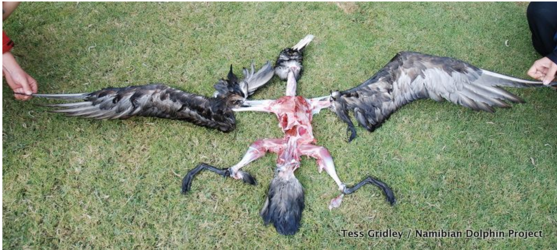
Fig 4 - Remains of southern giant petrel which were retrieved after the Cape Fur Seal departed. Note missing gut and flesh from breast and belly.