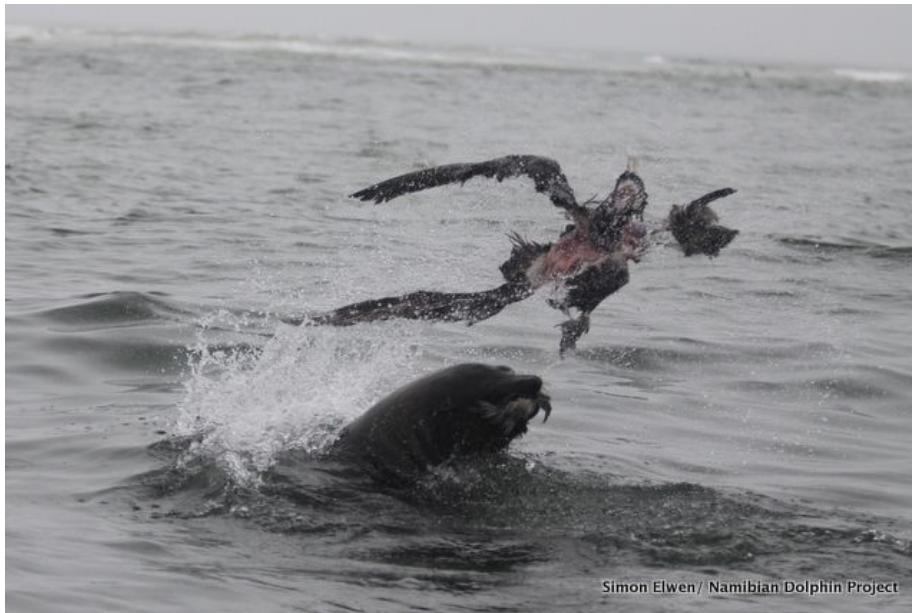
Fig 3 - Cape fur seal in the process of killing the southern giant petrel.

Pelican Point does not hold any breeding colonies of bird species typically taken by Fur Seals. However, large numbers of Cape Cormorants that nest on the man-made guano platform ~10km east of Pelican Point regularly roost on the beaches in the vicinity of the Pelican Point seal colony and form rafts at sea, providing potential prey for seals. The feeding of seals by marine tour operators in Walvis Bay probably encourages some individual seals not to forage out at sea and seek food in the vicinity of the tour boats instead. This practice might create conditions reinforcing the predatory behaviour of seals on seabirds in Walvis Bay.