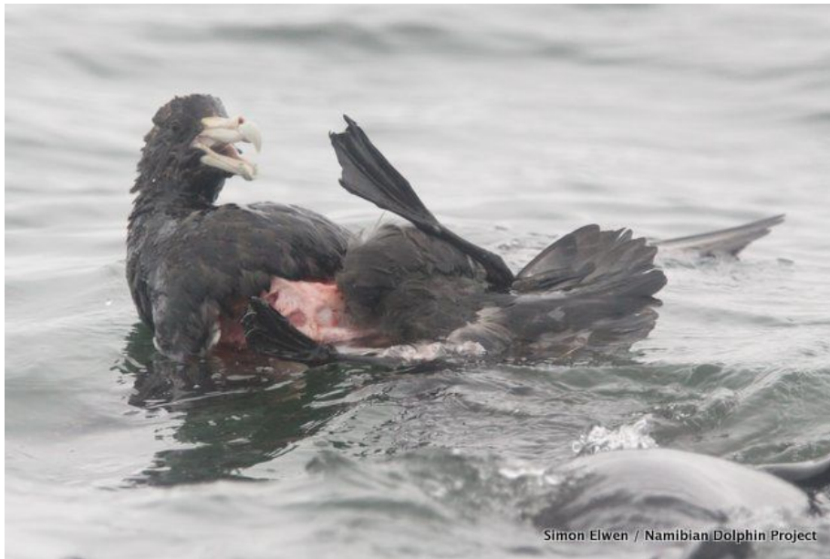
Fig 2 - Southern Giant Petrel during attack by the Cape fur seal on 14 August 2012. Note position of bites on lower body suggesting bird was attacked from beneath.

since 2008 when dolphin surveys began. The increase in sightings may be linked to the increasing size of the seal colony, and associated carrion available here.