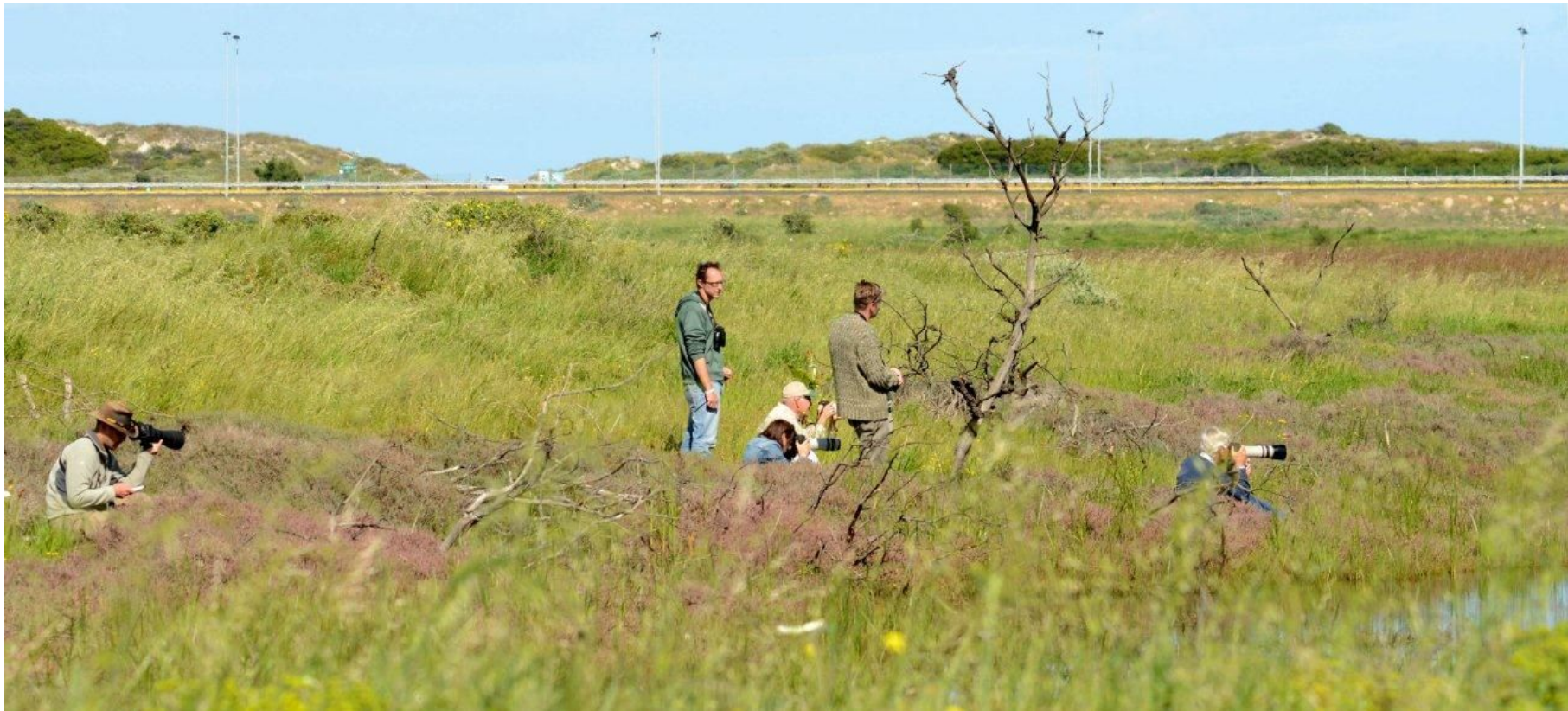
Fig 3 – Birding enthusiasts twitching the Black Skimmer at Rietvlei Nature Reserve, Milnerton, Western Cape.