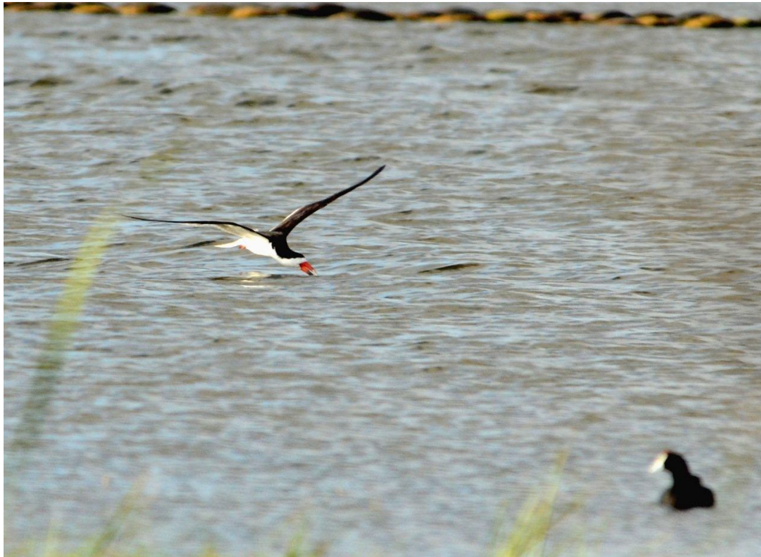
Fig 2 - Black Skimmer skimming the water at Rietvlei Nature Reserve, Milnerton, Western Cape.