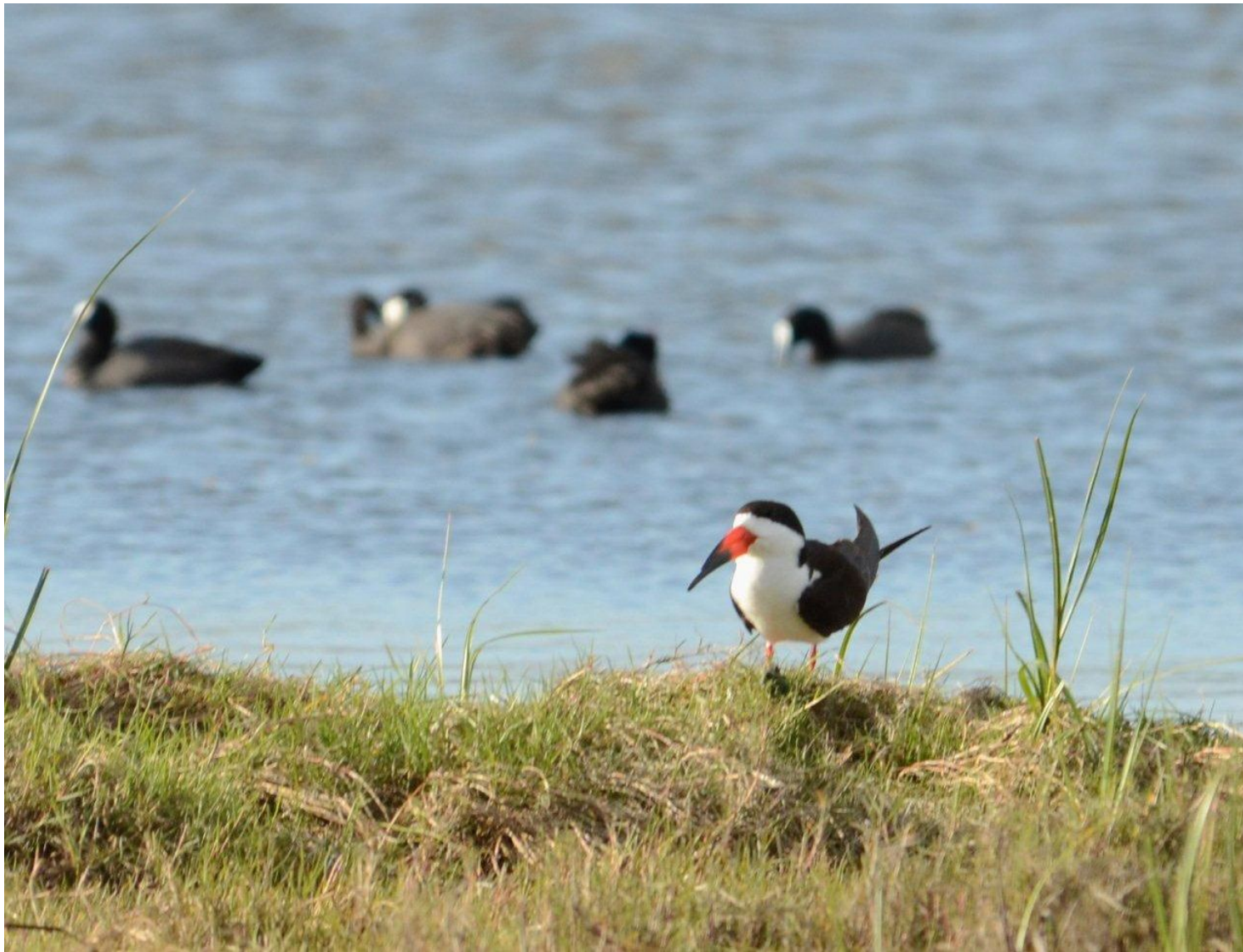
Fig 1- Black Skimmer at Rietvlei Reserve, Milnerton, Western Cape.