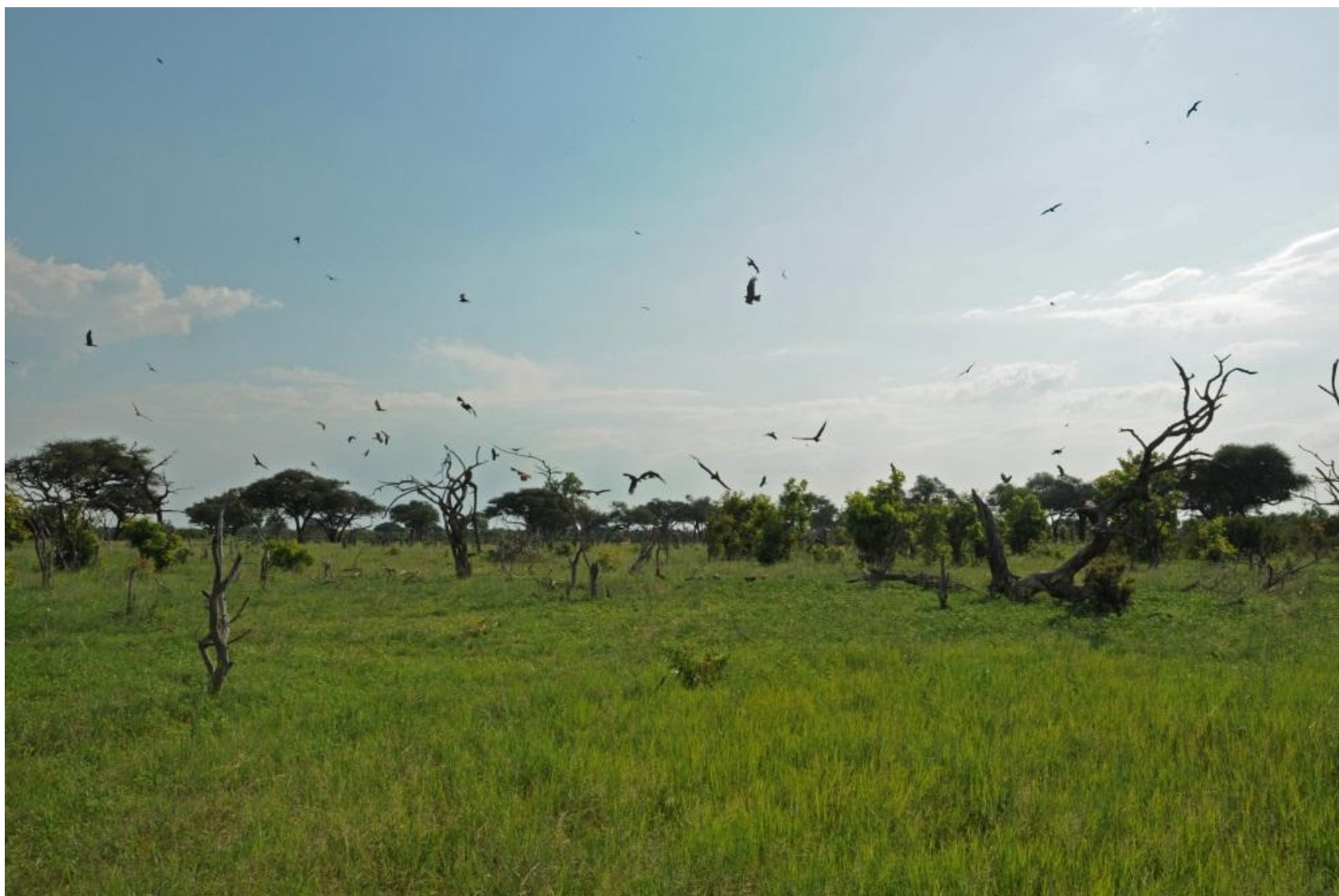
Fig 3 – Arrival of around 50 Yellow-Billed Kites on the site