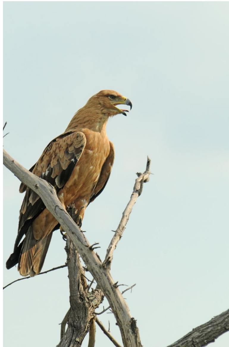
Fig 8 – A Tawny Eagle perched on a tree close to the termite dispersion. The tawny-coloured plumage and pale eye are characteristics.