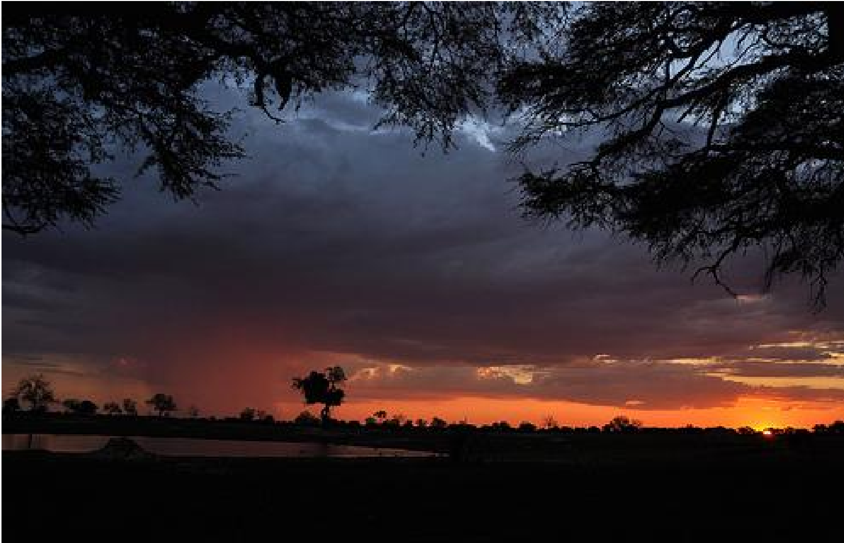
Fig 1 – Ngweshla pan in Hwange National Park