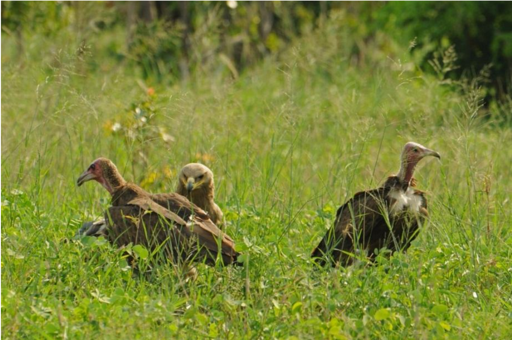
Fig 5 – Two Hooded Vultures and a Steppe Eagle on the ground