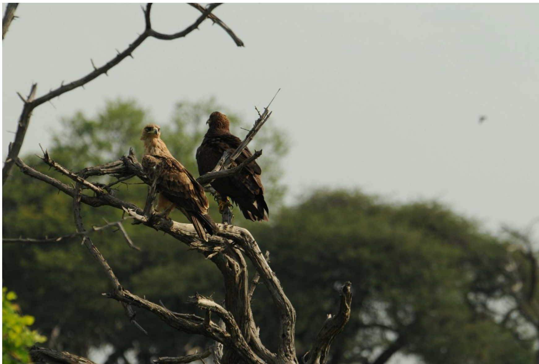
Fig 7 – Left: Tawny Eagle based on size and rich tawny-coloured plumage. Right: Adult Steppe Eagle based on larger size and dark, uniform plumage.