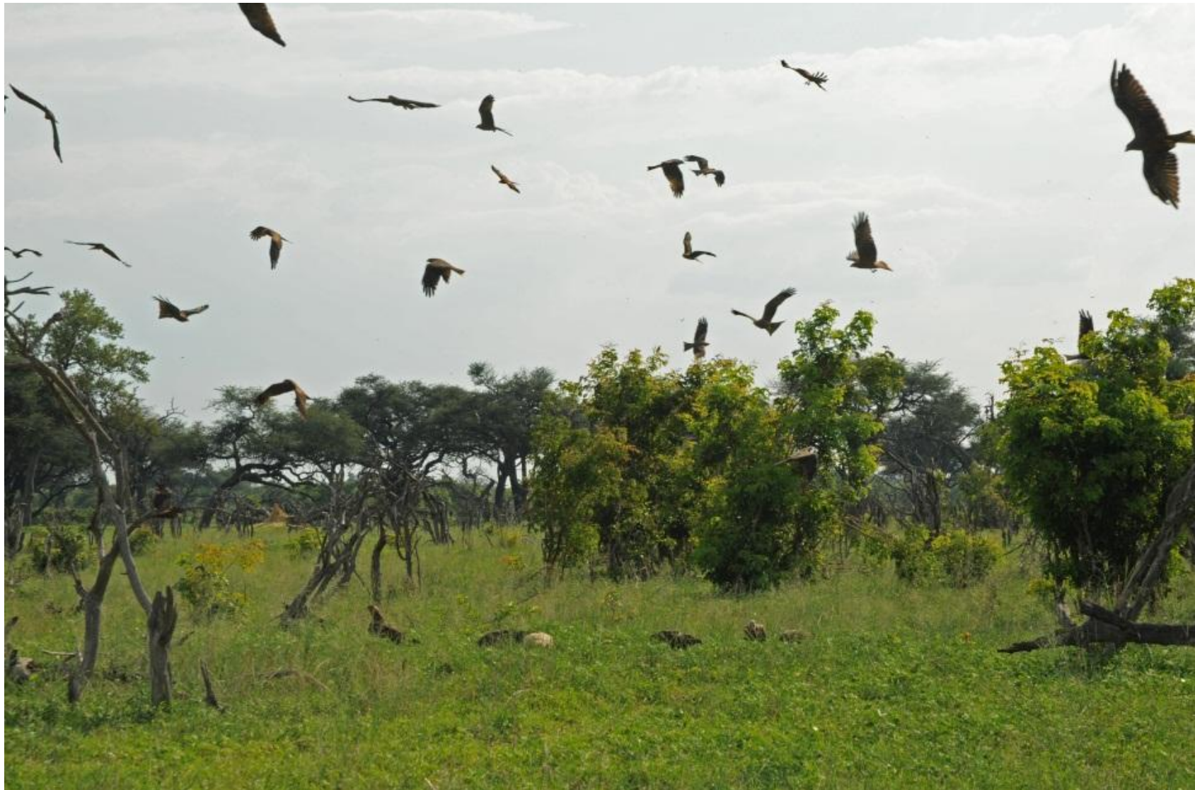
Fig 4 – Eagles and vultures on the ground, kites flying above – feeding on the emerging termites.