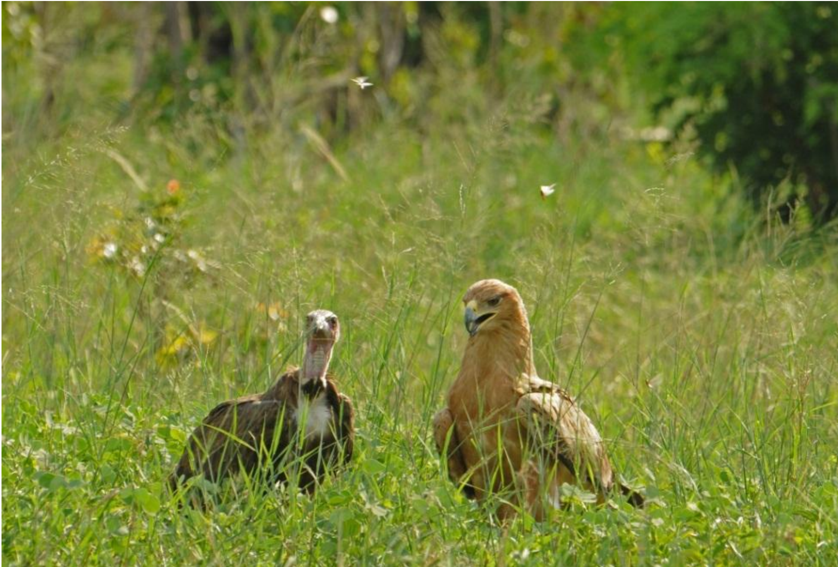
Fig 2 – A Tawny Eagle and a Hooded Vulture feeding on termites