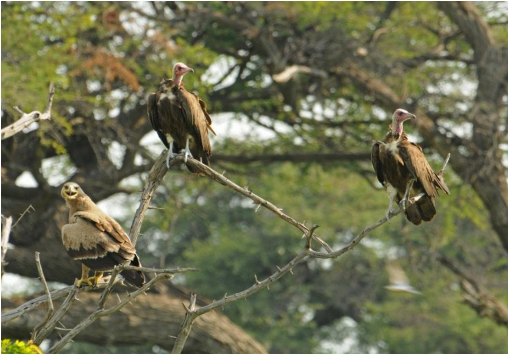
Fig 6 – Hooded Vultures and a Steppe Eagle perched on a tree close to the termite dispersion