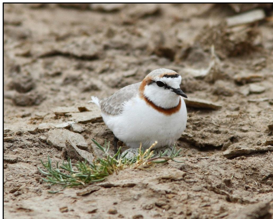
Fig 2 - Male Chestnut-banded Plover incubating/shading eggs. The nest consisted of little more than a shallow scrape between drying mud flakes, adjacent to a small succulent plant, and was situated approximately 40-50 m from the shoreline.

To our knowledge, breeding has not been recorded in the region in recent years, although Tarboton et al. (1987) mentions eggs and young from Barberspan (1955, 1970) and near Lake Chrissie (1986).