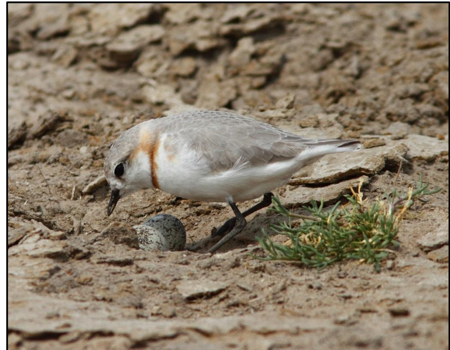
Fig 3 - Female at the nest. The two eggs were pale greyish white, with pale grey markings overlaid by blackish brown 'scribbles'.

Nial Perrins first reported the presence of these birds at Leeupan. We urge other birders to likewise report sightings – and especially