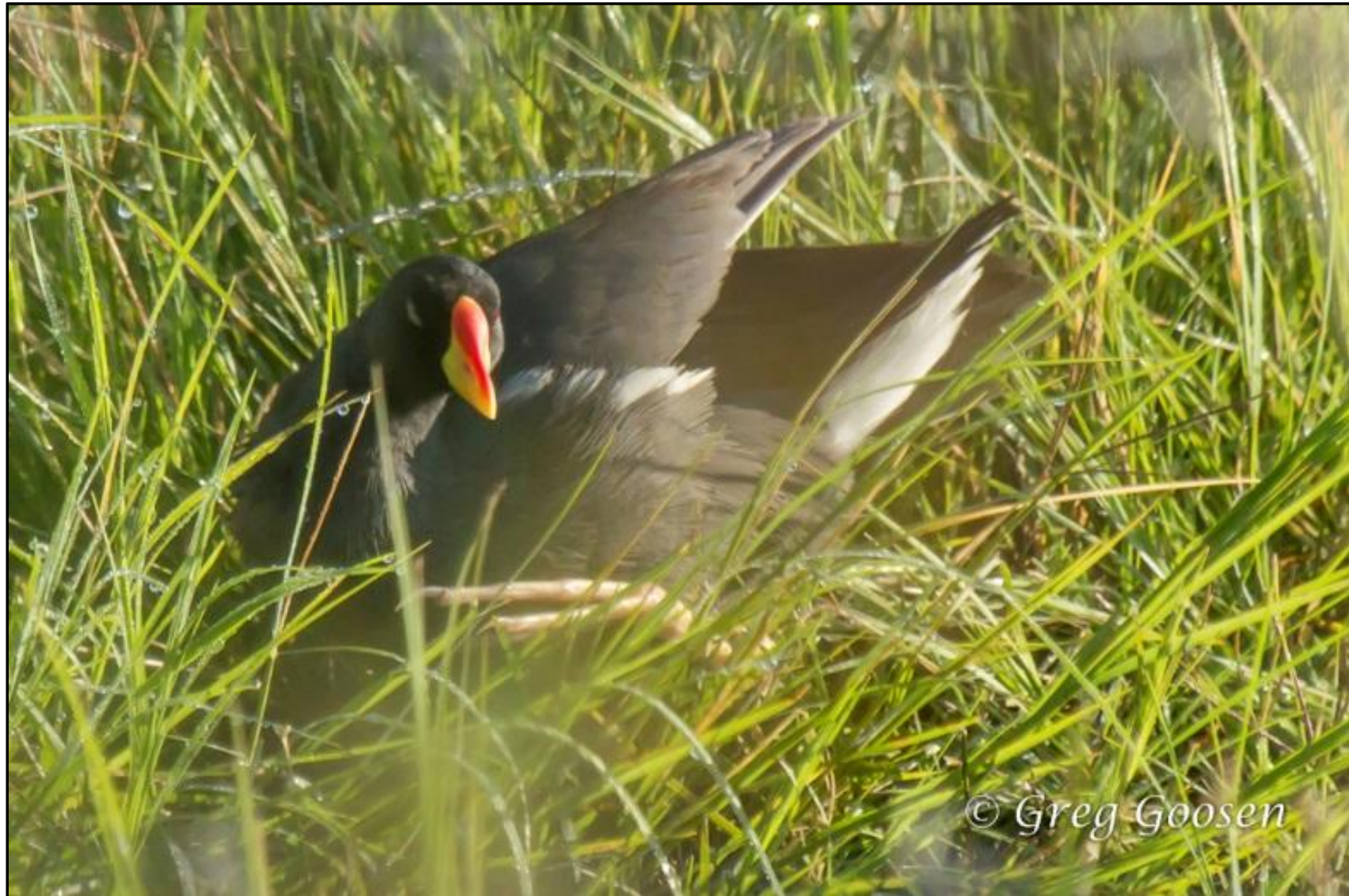
Fig 2 - One of the Lesser Moorhens Gallinula angulata that was observed at the pan.